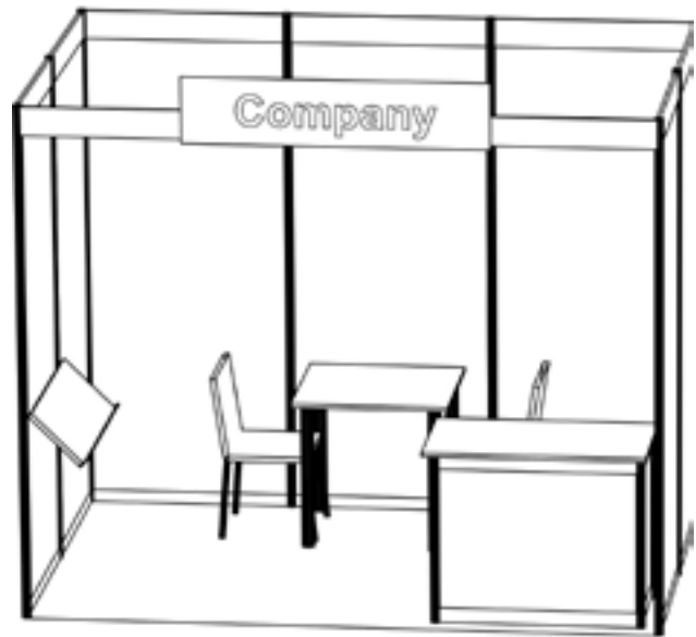
Alternative 1, Complete Stand

Dismantling of the stands will start at 4:30 pm, after the final coffee break.